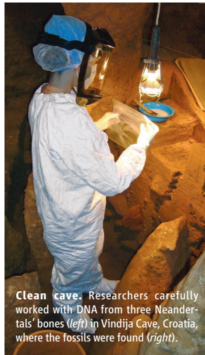
Clean cave. Researchers carefully worked with DNA from three Neandertals’ bones (left) in Vindija Cave, Croatia, where the fossils were found (right).

The team measured the genetic proximity of Neandertals to pairs of modern humans from different continents, first using single-nucleotide polymorphisms (SNPs), or sites in the genome where a single nucleotide differs between individuals. When they compared a Neandertal with a European and an Asian, they found that the Neandertal always shared the same amount of derived (or more recently evolved) SNPs with each of them. But when they compared a Neandertal with an African and a European, or with an African and an Asian, the Neandertal always shared