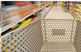
The 20 Best Foods in Your Grocery Store