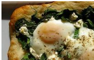
The 20 Best Ways to Use Eggs